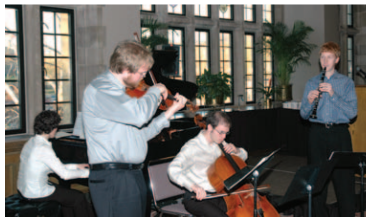
Kolot Ensemble performs at 2008 JS student-faculty dinner.

Fall 2008 events will include: the first Hebrew Table on Tuesday, September 9 at 5:30; Meet the JS Faculty at dinner on Monday, September 15; and, the JS Fall Welcome Dessert on Thursday, September 25, 4:30-6:00 p.m.