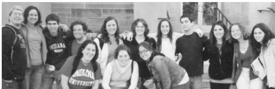
JS FIG students on fieldtrip to Lilly Library